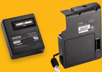
Rechargeable Li-ion Battery (PA-BT-4000Li) & Battery Base (PA-BB-003)

Keep your printer fully powered when unplugged with the rechargeable battery.