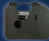
Ink ribbon (TR-100BK)

Cuts the tubes into the specified length